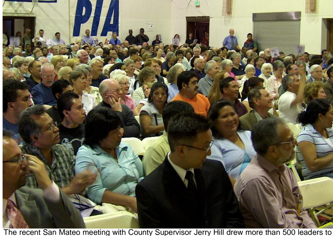
hear about adult health insurance.