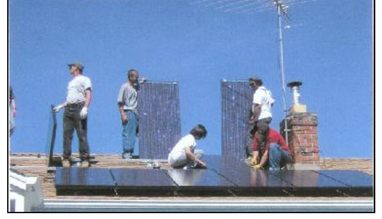
Volunteers installing solar panels

The program is operated by GRID Alternatives, a nonprofit organization working to bring the benefits of renewable energy and ener-